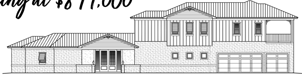
RICHARDS ROAD CONCEPT FRONT 1-19-21

4 bedroom plus bonus room 3 bathroom | 3 car garage | private pool 2,931 sq ft under air | 4,075 sq ft total